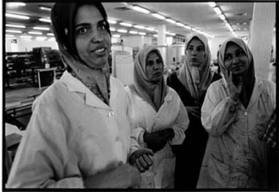
Baghdad Iraq 2003 Workers at the State Leather Industry Factory the largest shoe factory in the Middle East.

The Oregon AFL-CIO and Co-sponsoring Labor and Community groups including Education Without Borders and KBOO 90.7 FM Portland Community Radio Invite the public to a rare opportunity to hear two Iraqi trade union leaders